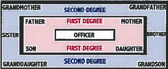
AFFINITY KINSHIP CHART